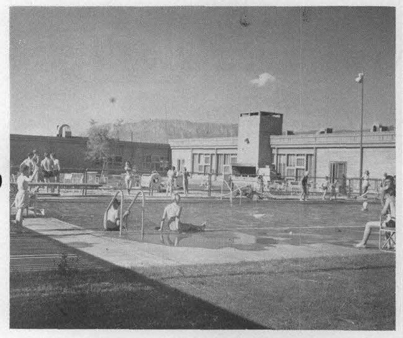
COOL, COOL WATER, that's what the Coronado Club pool, recently opened, offers during the coming hot summer months. Swimming, anyone?